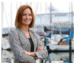
Leibniz Appointments Standards

Standards für die Besetzung von wissenschaftlichen Leitungspositionen in der Leibniz-Gemeinschaft Standards for the appointments to academic management positions within the Leibniz Association