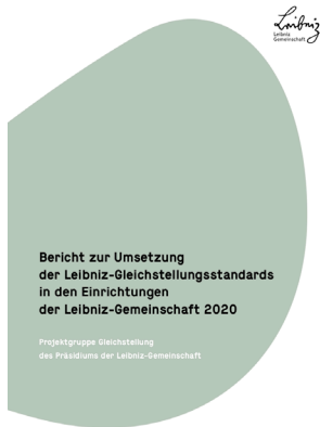
Leibniz Equality Report 2017 as well as 2020